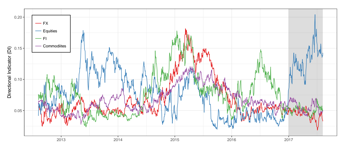
Figure 3. The last 5 years of the Directional Indicator (DI) by sector. In 2017 only equities exhibited persistent directional moves, with other sectors showing little or no directionality. Contrast this to 2014, where all sectors participated. The divergence in the level of DI for equities compared to other sectors is significant.

Post-2015 there have been relatively few exploitable trends. One significant exception is the move in equities in 2017, characterized by significant price appreciation coupled with low volatility; however, this only represents a fraction of the overall investment universe.